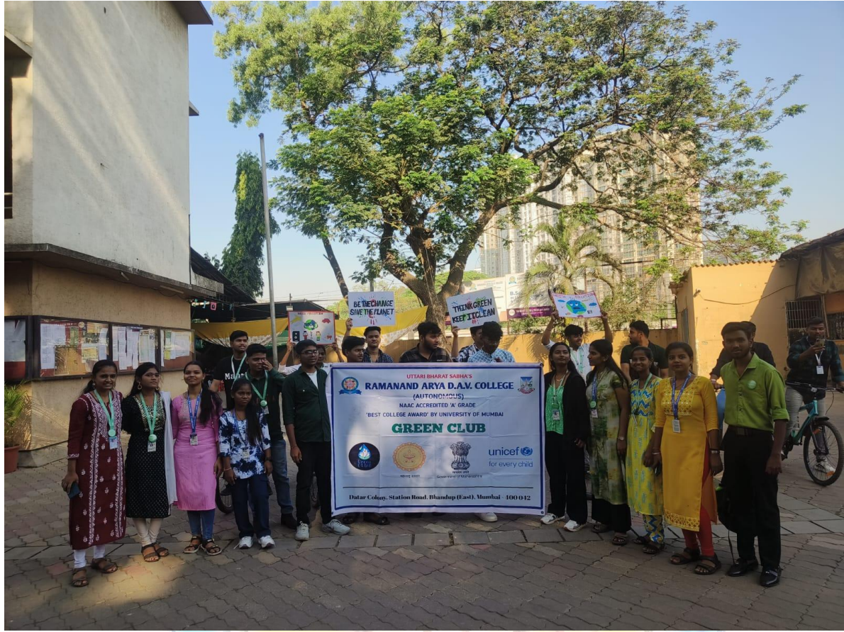
Cycle Rally at EcoUtopia