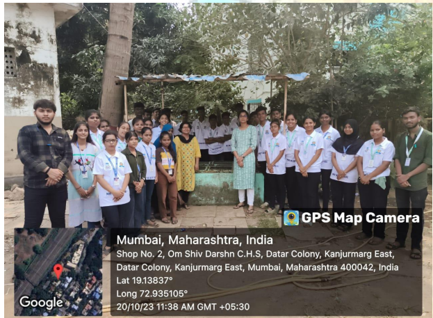
Lecture on Snake Awareness