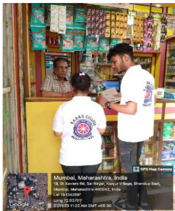
Paper Bag Distribution by NSS volunteers