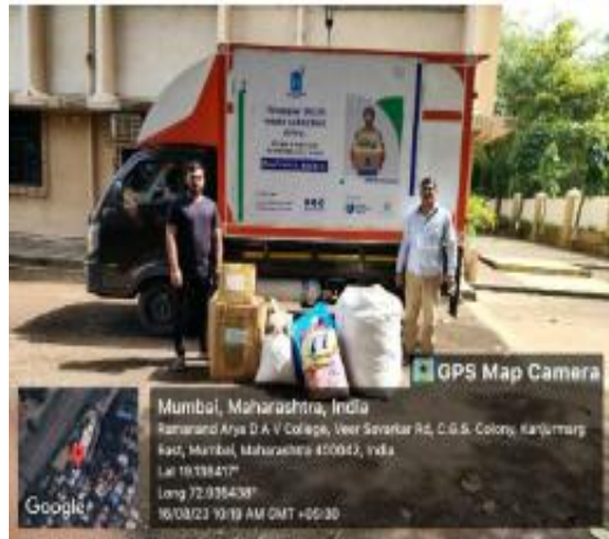
E- Waste Collection by NSS and handover to Safai Bank of India