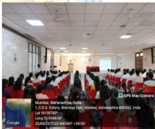
Blood Donation camp and awareness