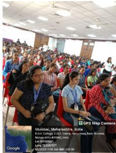
Awareness lecture on RTO