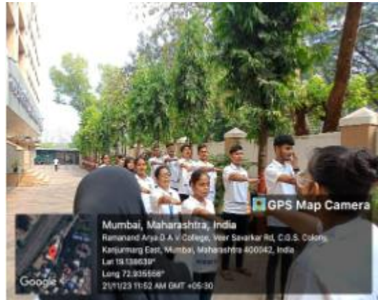
Pledge on 'Meri Maati Meri Desh'