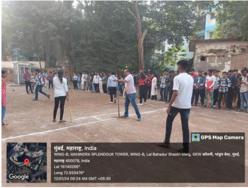
Box Cricket Event