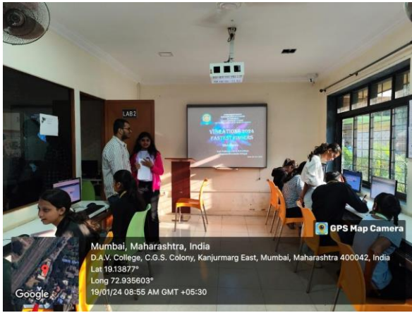
Fastest finger Event