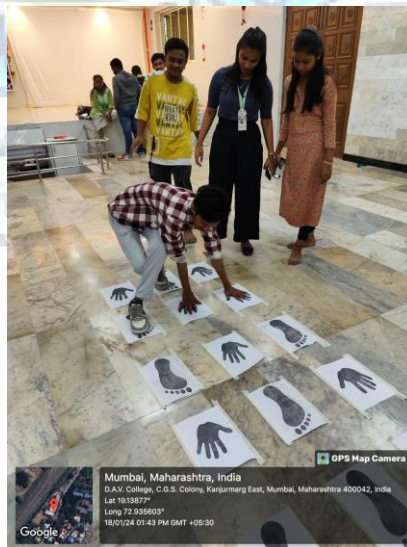
Winners Digital Ishtihaar Event