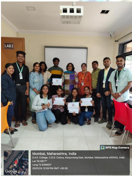
Ludo Event Winners