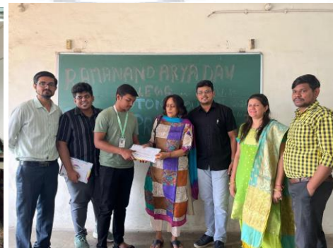
GK Quiz Event