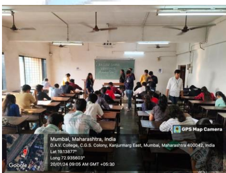
Accounting Quiz Event