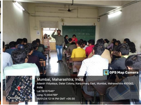
Stock Mock Event