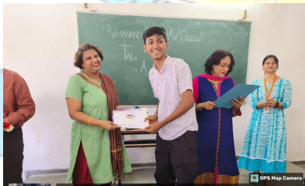
Tag A Pic