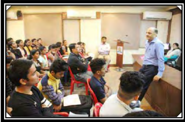
THE CONFERENCE ROOM